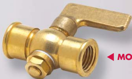
◀ MODEL A12

1/4" NPT female connections. In polished brass suitable for pressure to 200 psi hydraulic. Specify Type A12 .