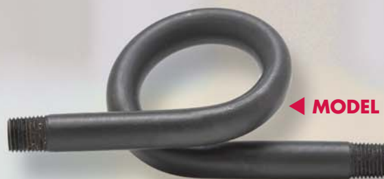
◀ MODEL AO31

Schedule 40 Steel (for max. 500 PSI and 400°F) Specify Type AO31 . 1/4" NPT. Brass (for max. 250 PSI and 400°F specify type AO3B ).