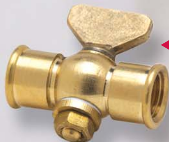
◀ MODEL A10

In polished brass (suitable for pressure to 125 PSI hydraulic) Specify Type A10 1/4" NPT female connections. A11 1/4" NPT male x female