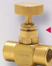
◀ MODEL BBV4

Brass, 1/4" NPT female connections only. Suitable for 600 psi at 300° F maximum; for water, oil or gas service.