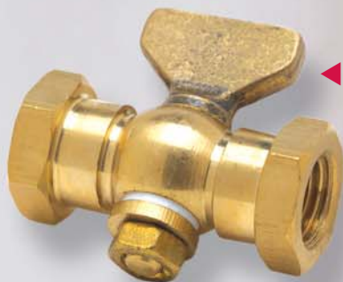
◀ MODEL A10E

In polished brass for pressures to 200 psi hydraulic, 1/4" NPT female connections with hex shoulders.